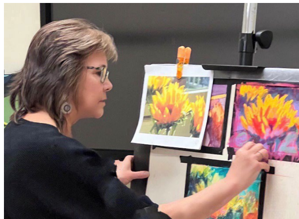
Tammy's Underpainting on Uart