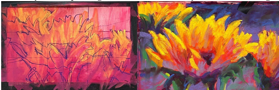
Tammy's Finished Painting