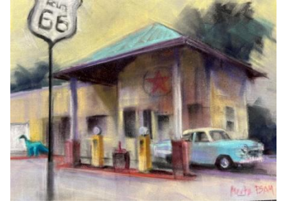
The Old Station - Rt 66, pastel, 10 x 12

Tuition: $305.00 for PSSC Members (NOTE: Southeastern Pastel Members are eligible for the PSSC Member rate) $350.00 for Non-Members