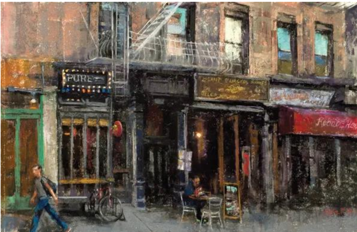
Nancie King Mertz, Hell's Kitchen, pastel, 28 x 18

Please bring your own photographs with a variety of subject matter (not all the same scene or time of day). A full supply list will be sent to registrants well in advance.