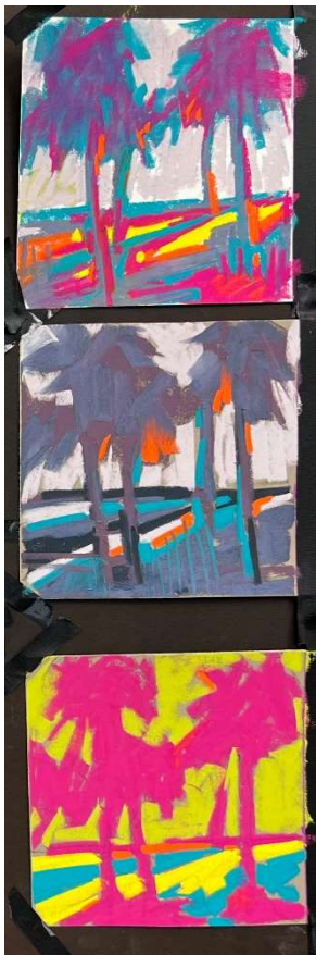
Tammy Papa color study

“It was thought provoking, sometimes brain bending, challenging and very satisfying.”