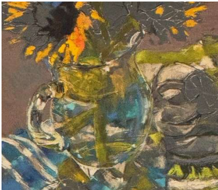
Jeri Greenberg Study

As an exercise, she suggested taking a tablecloth or a towel, and either hanging it on a wall, or laying it on a table to practice painting fabric representationally.