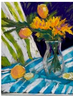
Lynne Tennyson Study